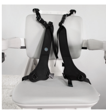
Not all options are shown.